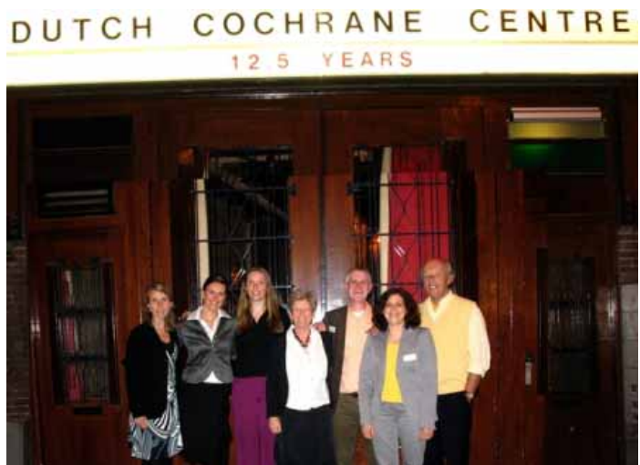
Celebrating 12½ years!

A choice of highly-esteemed speakers and chairs elicited many positive reactions from over 200 spirited attendees. They were also very pleased to be able to meet so many famous Cochranites, and many well-known Dutch colleagues. The reflections on EBM were followed by reflections on life by the Zwoelie Troelies (a popular entertainment act). Their hilarious "polite thank you" after each act made the audience more and more enthusiastic.