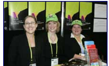
Volunteers from the Australasian Cochrane Centre welcome participants to Melbourne

Another great aspect of the Melbourne Colloquium was the spotlight on developing countries. In the wake of the tsunami that hit some of these countries almost a year back, there was genuine concern and co-operation extended to understand the hurdles in the practice, pursuit and promotion of evidence-based medicine in this region. This is a very welcome change because it is an important step to ensure that the overall efforts of the Collaboration ultimately "make a good thing better." This is a trend that must be encouraged and nurtured in future Colloquia as well.