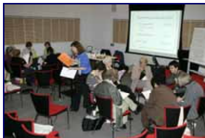
Participants share skills and experiences at one of the many workshops

Any mention of the Melbourne Colloquium would be incomplete without a word about the city itself. To put it simply, Melbourne is friendly, spirited and alive, making it