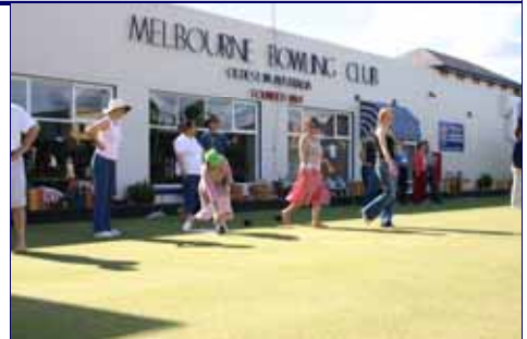
Fierce competition at the Colloquium Cup lawn bowls tournament

After brief lessons from a local expert, competition got under way, accompanied by cold beer and sausages.