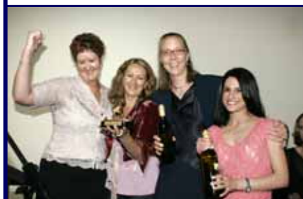
The winning team: 'Crackerjack'

Showing great skill with the unevenly weighted bowls, local Australian team 'Crackerjack' proudly took home the trophy. Congratulations to them, and to the runners-up from the UK.