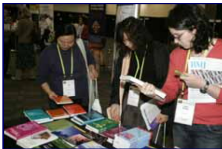
Participants pick up the latest publications at a booth in the poster exhibit hall

Navigating myself through the display tables was quite a feat as a first time experience (I had slept in and missed the newcomer orientation at 8:00am!). Congregations mingled and chatted freely around the thematic tables, coffee cups in one hand and continental breakfast items piled precariously in saucer size dishes in another. What